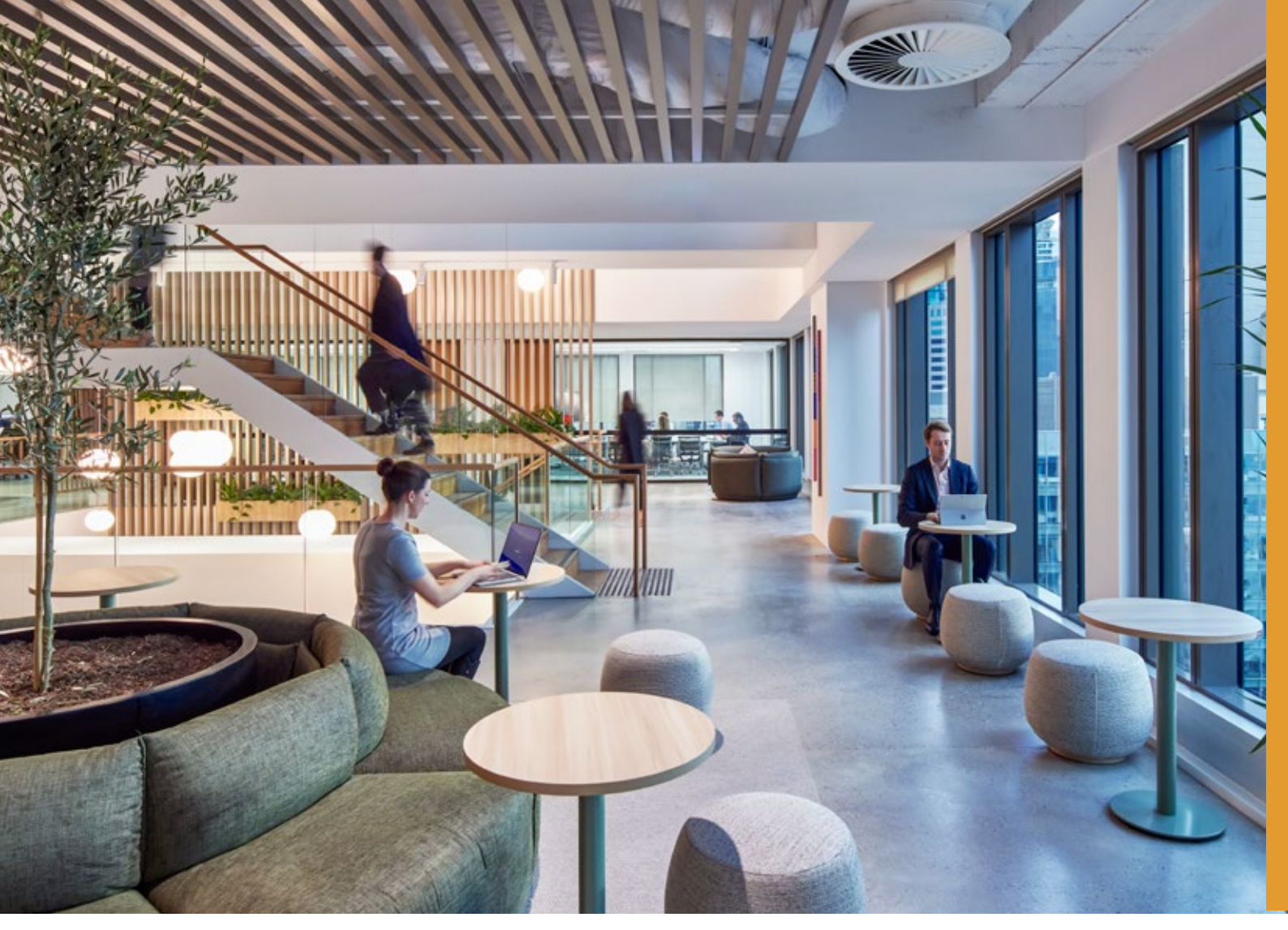
The images in this section 2 are of Charter Hall Group offices, not images of underlying Fund properties.