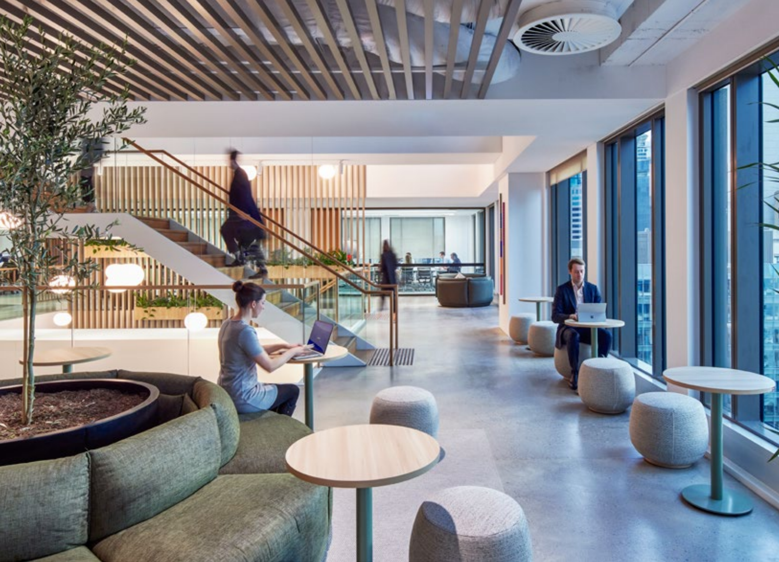
The images in this section 2 are of Charter Hall Group offices, not images of underlying Fund properties.